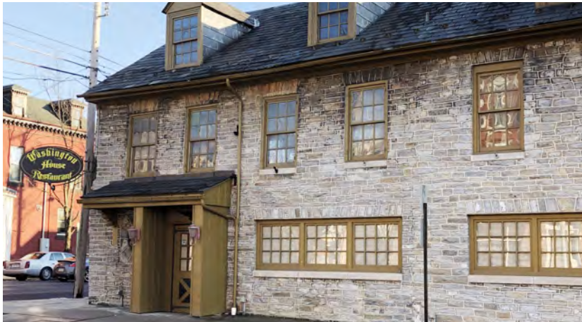
1000 Cumberland St. Lebanon, PA 17042