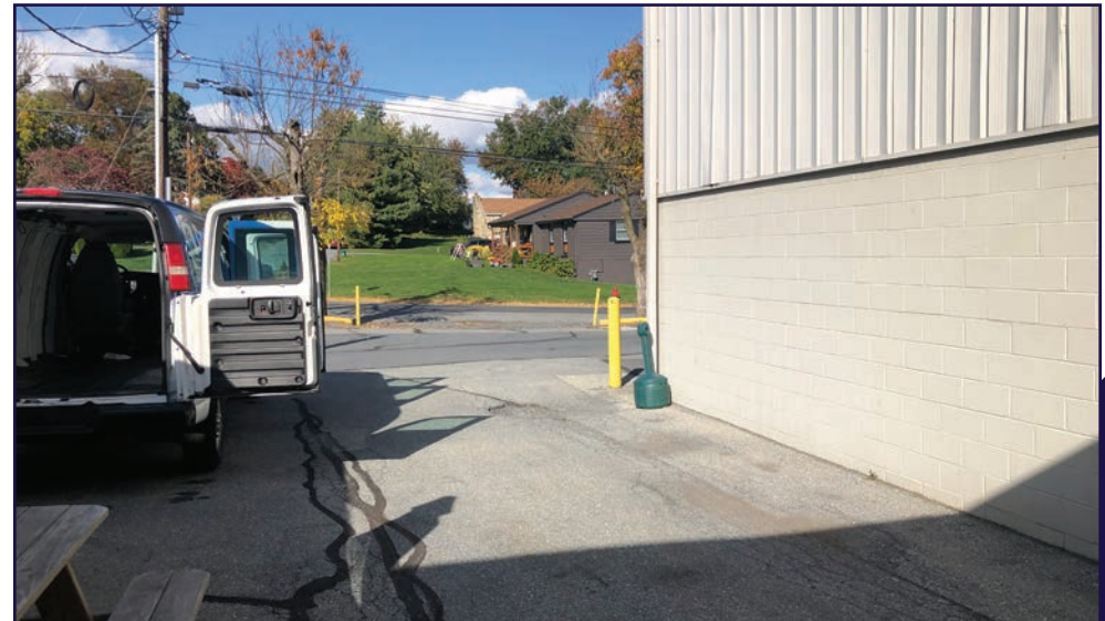
REAR DRIVE-IN DOOR ACCESS

For More Information Call: 717.850.TRUE (8783) | www.TRUECommercial.com