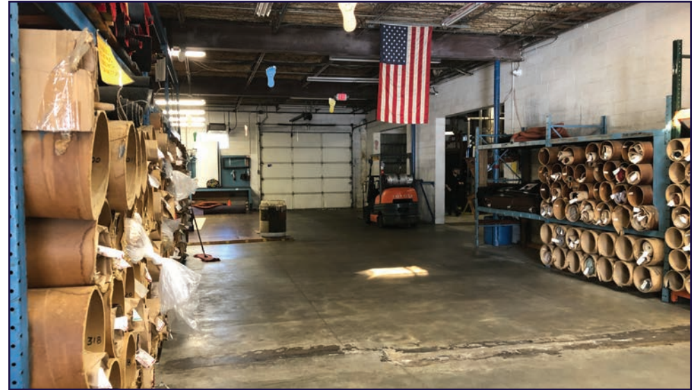
SPACE EXISTING - ACCESS BAYS TO BE FILLED