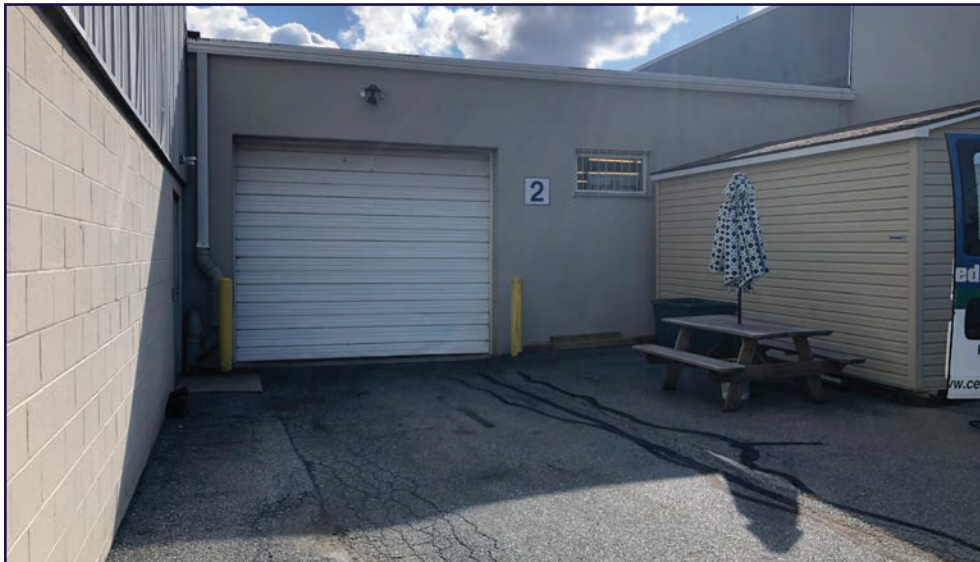
REAR DRIVE-IN DOOR